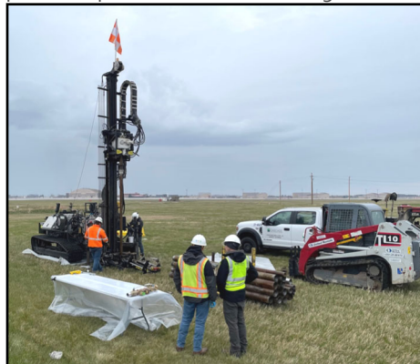
Drilling activities in May 2022

After the RI is complete, a Feasibility Study will evaluate alternatives to address unacceptable risk to human health and the environment.