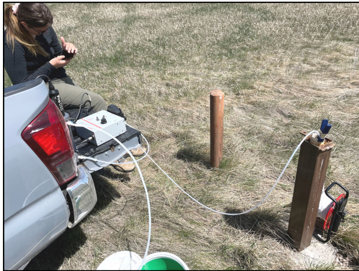
An environmental scientist from BEM/Arcadis logs purge measurements into a tablet prior to collecting a groundwater sample in May 2022.

The goal of the split sampling event is to confirm that both methods provide comparable results that can be used for making future decisions.